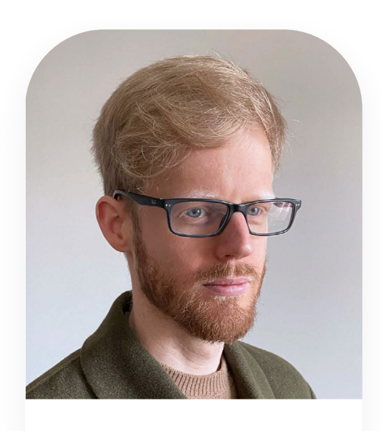
André Lameiras ESET Security Writer

Although many enterprises and small and medium businesses (SMBs) take advantage of solutions such as Slack or Microsoft Teams for collaborative work, these platforms are still trying to figure out better ways to create meaningful interactions between staff members. While these companies prioritize workflow, there's also a growing need to reinforce social connections through a virtual company culture that enhances engagement and a feeling of belonging among workers, both with those who work remotely and those who work in hybrid mode. These virtual hallways are, in many ways, a needed replacement for in-between discussions that typically happen by the copier or in the office corridors.